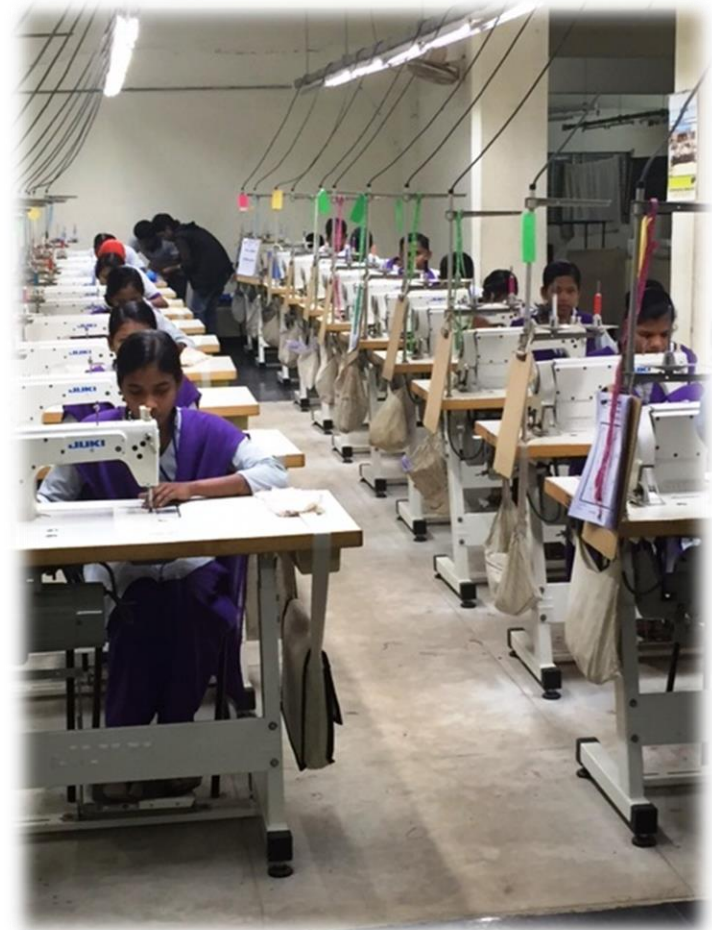
Students in rural Orissa undertaking a Sewing Machine Operator course