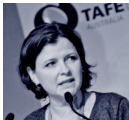
Ged Kearney, ACTU President