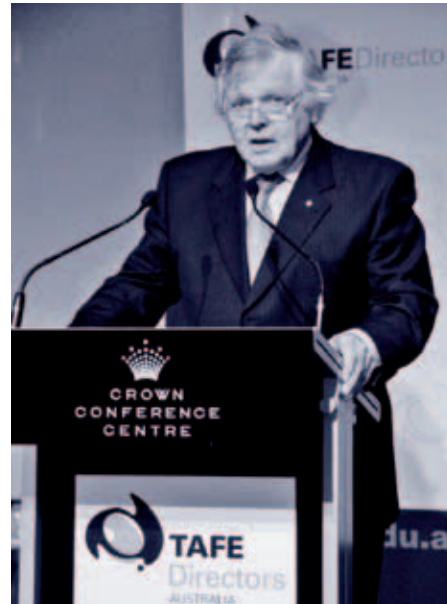
The Hon. John Dawkins AO, Chair AQFC and Chair NQC